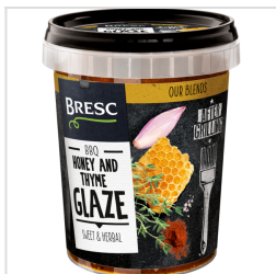
Honey and thyme glaze 450g