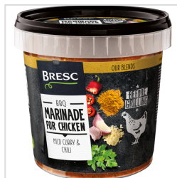
Marinade for chicken 1000g