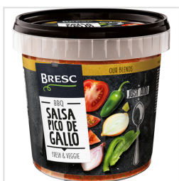
Pico de gallo 1000g