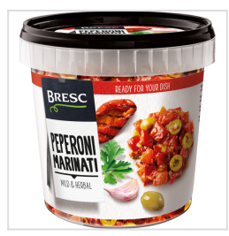
Bresc Peperoni marinati 1000g