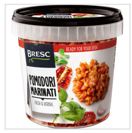
Bresc Pomodori marinati 1000g

Stack the sandwiches in layers with ample mayonnaise between the layers. When the stacks are ready: skewer them with a cocktail stick and serve some of the mayonnaise "on the side".