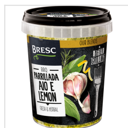
Bresc Parrillada Aio e Lemone 450g