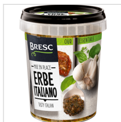
Bresc Erbe Italiano 450g