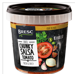
Bresc Chunky salsa tomato 1000g