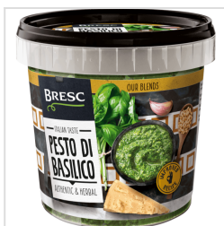
Bresc Pesto di basilico 1000g