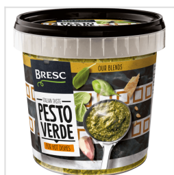
Bresc Pesto verde 1000g