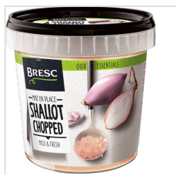
Bresc Chopped shallot 1000g