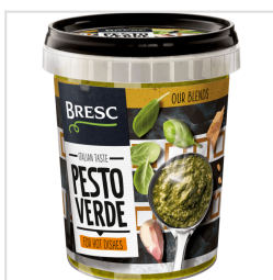
Bresc Pesto verde 450g