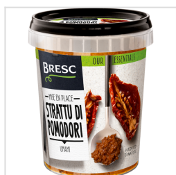
Bresc Strattu di pomodoro 450g