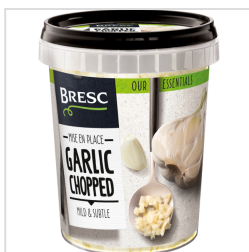
Bresc Garlic chopped 450g