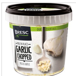
Bresc Garlic chopped 1000g