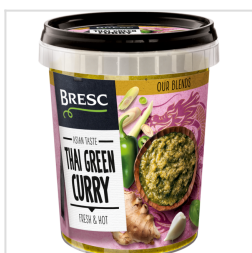
Bresc Thai green curry 450g