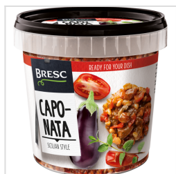
Bresc Caponata 1000g