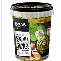
Bresc Pesto alla Genovese 450g