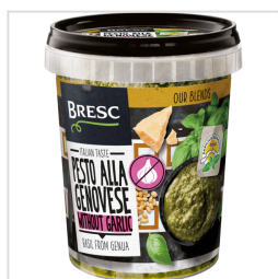
Bresc Pesto alla Genovese without garlic 450g