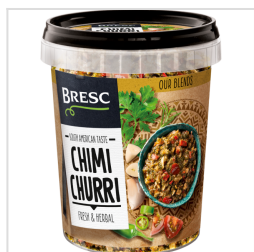
Bresc Chimichurri herb mix 450g