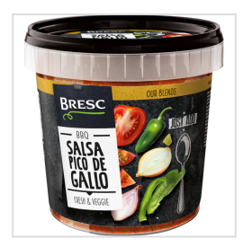
Bresc Pico de gallo 1000g