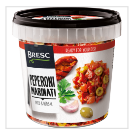
Bresc Peperoni marinati 1000g