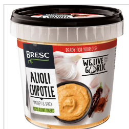
Bresc Alioli Chipotle 1000g