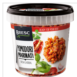
Bresc Pomodori marinati 1000g