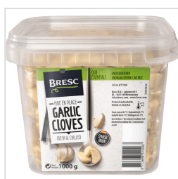
Bresc Garlic cloves 1000g