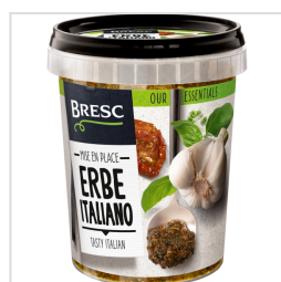
Bresc Erbe Italiano 450g