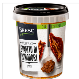
Bresc Strattu di pomodoro 450g