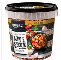
Bresc Aglio e peperoncino 1000g