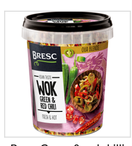
Bresc Green & red chilli WOK 450g