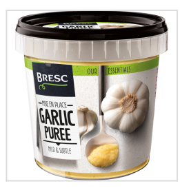
Bresc Garlic puree 1000g