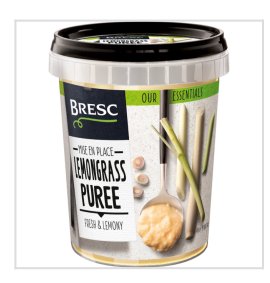
Bresc Lemongrass puree 450g