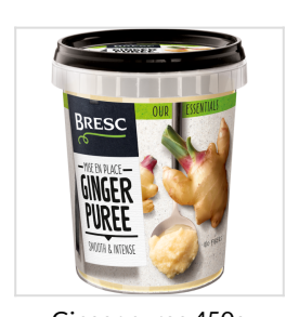
Ginger puree 450g