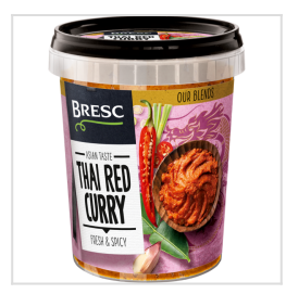
Bresc Thai red curry 450g