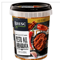
Bresc Pesto all'Arrabbiata 450g