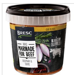
Bresc Marinade for beef 1000g