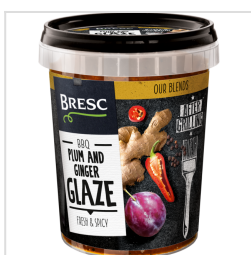
Bresc Plum and ginger glaze 450g