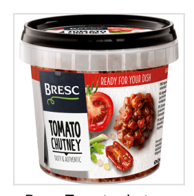
Bresc Tomato chutney 325g