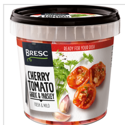
Bresc Sweet 'n sour Cherry tomatoes garlic parsley 1100g