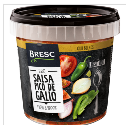
Bresc Pico de gallo 1000g